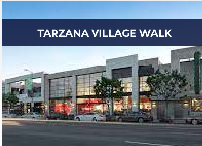
TARZANA VILLAGE WALK