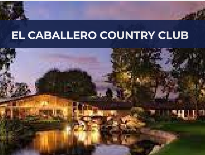
EL CABALLERO COUNTRY CLUB