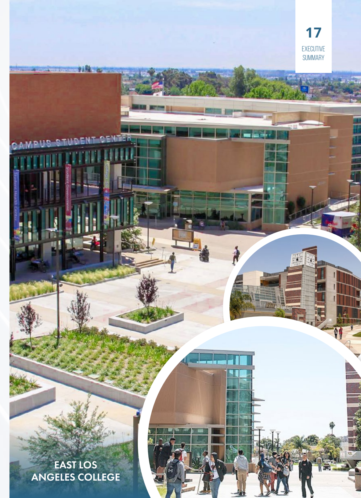
EAST LOS ANGELES COLLEGE

FREEWAY PLAZA 212 S ATLANTIC BLVD | LOS ANGELES, CA 90022