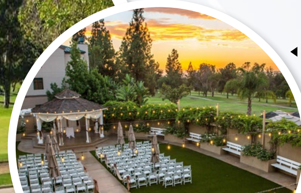
◀ QUIET CANNON EVENT CENTER 1.9 Miles from the Subject Property