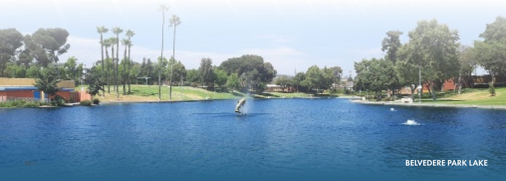
BELVEDERE PARK LAKE

center at the corner of S. Atlantic Boulevard and Pomona Boulevard. Adjacent to East LA College, directly northeast of the center is a Ralph's anchored shopping center home to national tenants including Starbucks, Chipotle, Panda Express, Jamba Juice, Thrifty Drugs, AT& T, IHOP, Big 5, and Boston Market. Across from that center sits a CVS Pharmacy anchored center with features a strong mix of retailers.