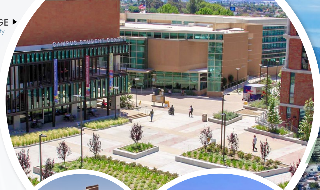
EAST LOS ANGELES COLLEGE ▶ 1.0 Miles from the Subject Property

Freeway Plaza is located 0.9 of a mile from East Los Angeles College, a public community college home to over 37,000 students. The signalized intersection of S. Atlantic Boulevard and Pomona Boulevard, just two parcels south of the center, is home to McDonald's and Pep Boys. Directly across from the center sits a three-story metro station parking structure. The Atlantic Metro Station is within walking distance to the center at the corner of S. Atlantic Boulevard and Pomona Boulevard. Adjacent to East LA College, directly northeast of the center is a Ralph's anchored shopping center home to national tenants including Starbucks, Chipotle, Panda Express, Jamba Juice, Thrifty Drugs, AT&T, IHOP, Big 5, and Boston Market. Across from that center sits a CVS Pharmacy anchored center with features a strong mix of retailers.